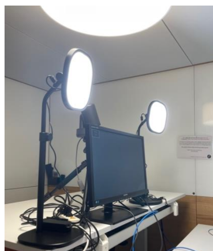
Fig. 1 and 2: Example of the setting (table is not included) for a video conference of only one person on-site (more professional setting for a video conference, e.g., for a job interview etc.).