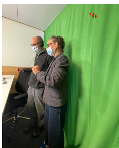
Fig. 3 and 4: Left is the result of the green screen = optimal background change. Right is the green screen.