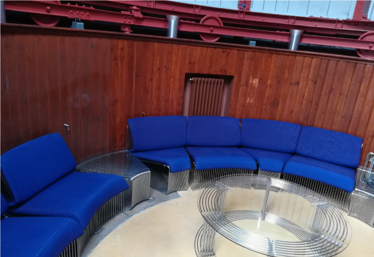
Small Observatory STW B20